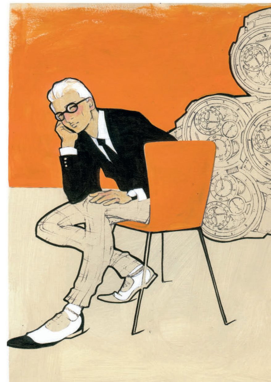
Seated Man Orange, 2010 Elsevier; acrylic on paper ↶ Arteixo, 2010 Inditex, annual report; embroidery ← Eckerle #6 and #5, 2007 Eckerle; pencil and fabrics on paper